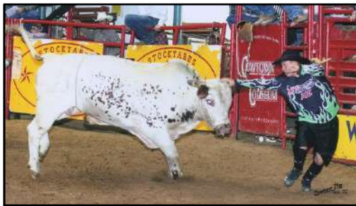
Protection Bull Fighting Page 7