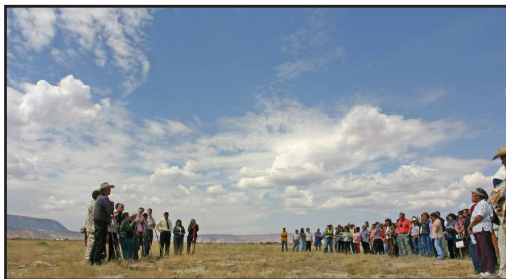
The community looks on for the groundbreaking ceremony.

Flintco, Inc., the largest Native American owned contractor in the world will be the company that will build the hospital and the 129 staff housing units for non-local professionals.