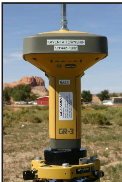
The Base of the new Topcon equipment which communicates with GPS satellites that orbit the earth.

For their next project they staked out the Animal Shelter for sewer and utilities. Then the Community Development Department assessed two business sites for the Economic Development Department. The two business site leases that are available are now entering the next stages for infrastructure design.