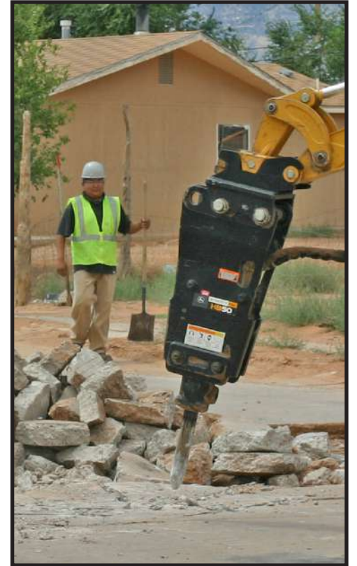
Township workers worked throughout the day removing the damaged section of the road.

Construction and repair work began on Wednesday, July 29, 2009, and the repairs in the road were completely by Friday, July 31, 2009 just in time for a safe school bus route as school began in early August. The damaged concrete road was removed with a KUSD #27 Haul Truck. The construction crew from the Kayenta Township repaired the road thereafter by laying down a layer of concrete for the road.