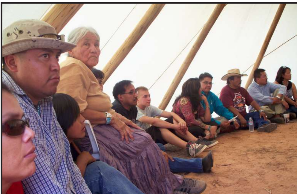
Presenters share information inside a teepee.