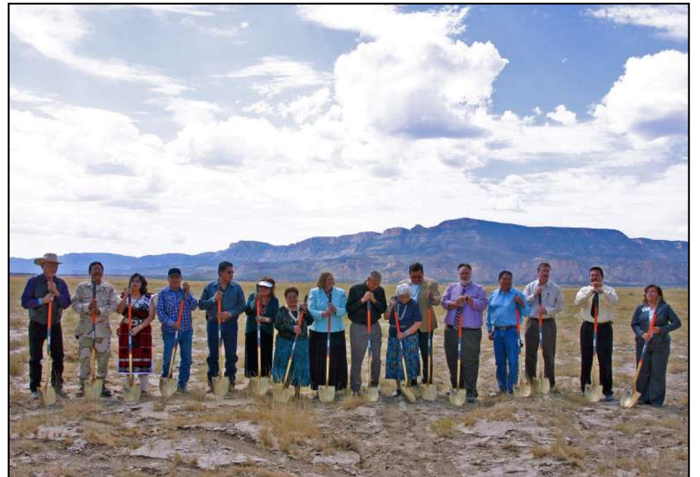
The official groundbreaking for Kayenta’s new hospital.