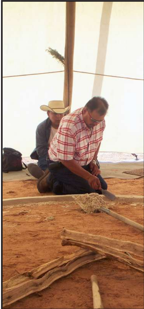
A ceremonial place is drawn.

KAYENTA, AZ – Almost a dozen teepees dotted the valley near the Todecheene residence just a few miles west of Kayenta on Saturday, July 25th this year as they hosted the Azee' Bee Nahagha of Dine Nation Youth (ABNDN) Education Convention. “Naasgo ne niji biniyhe,” a Navajo saying about planning for the future was this year's theme.