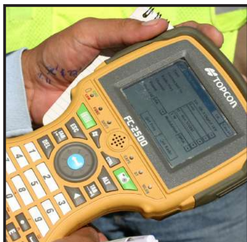
All data collected from GPS satellites from the field survey are stored in the data collector.