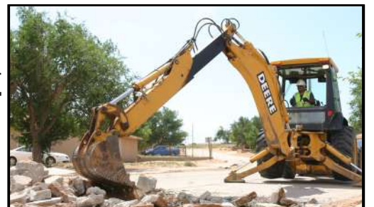
Local Road Improvement Pages 4 and 6

THE NEWSPAPER OF THE KAYENTA TOWNSHIP AND COMMUNITY A Free Publication from the Kayenta Township