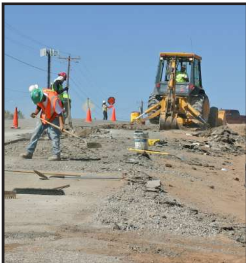
Township workers repairing the road to Wetherill Heights.