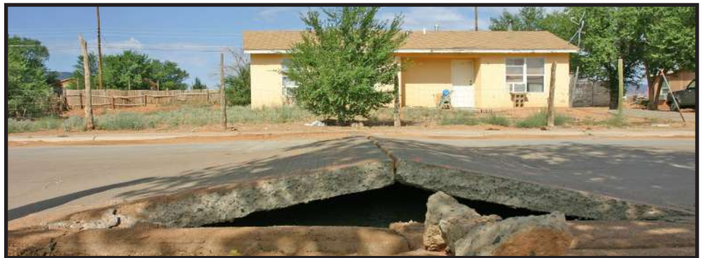
The major buckle in the road at the NHA Housing area before repairs were done.