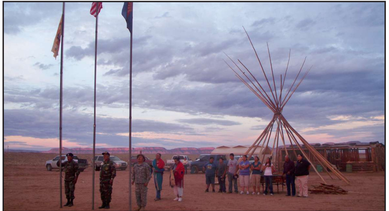
Early morning Posting of Colors, Youth Education Convention 2009.