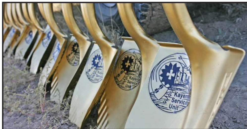
Groundbreaking shovels await the ceremony.