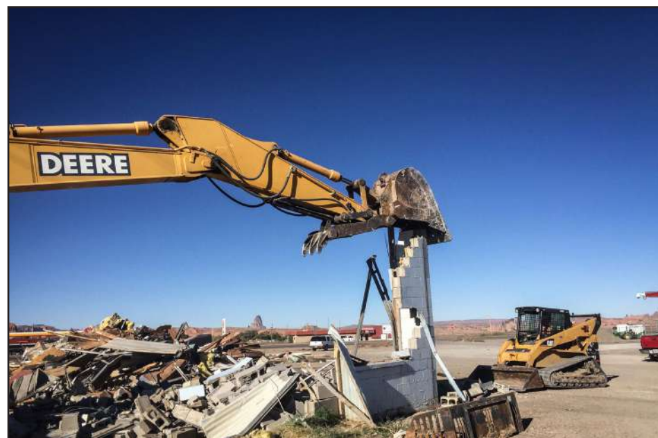
Kayenta, Ariz. - The old Speedy's Gas Station. Demolition project to provide for economic development in Kayenta.