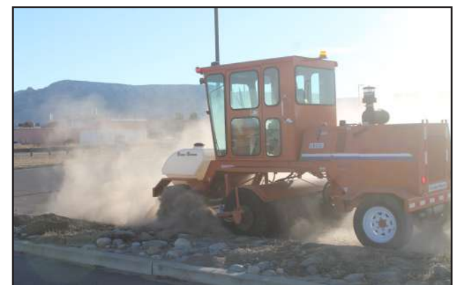
Kayenta, Ariz. - Street sweeper conducting cleaning routine at Kayenta U.S. Post Office. Sweepers cleaning dirt from gutter to keep Kayenta beautiful.