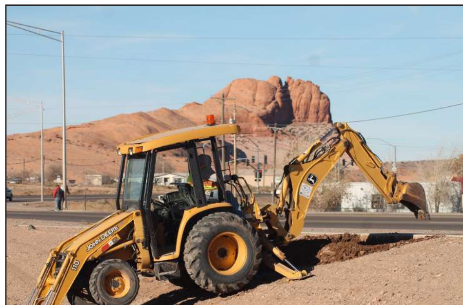
Kayenta, Ariz. - Making small additions to sidewalks for benches in around the Kayenta area. Benches are part of the Beautification Project.