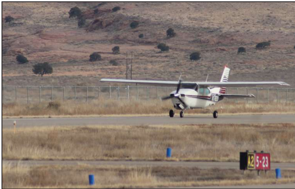
Kayenta, Ariz. - A plane coming in for a landing at Kayenta Airport.

ing enough room for several snow removal machines. It is estimated the snow removal building will be complete by January 2016. Construction of the facility is currently in production stages and should be in full operation by Spring 2016.