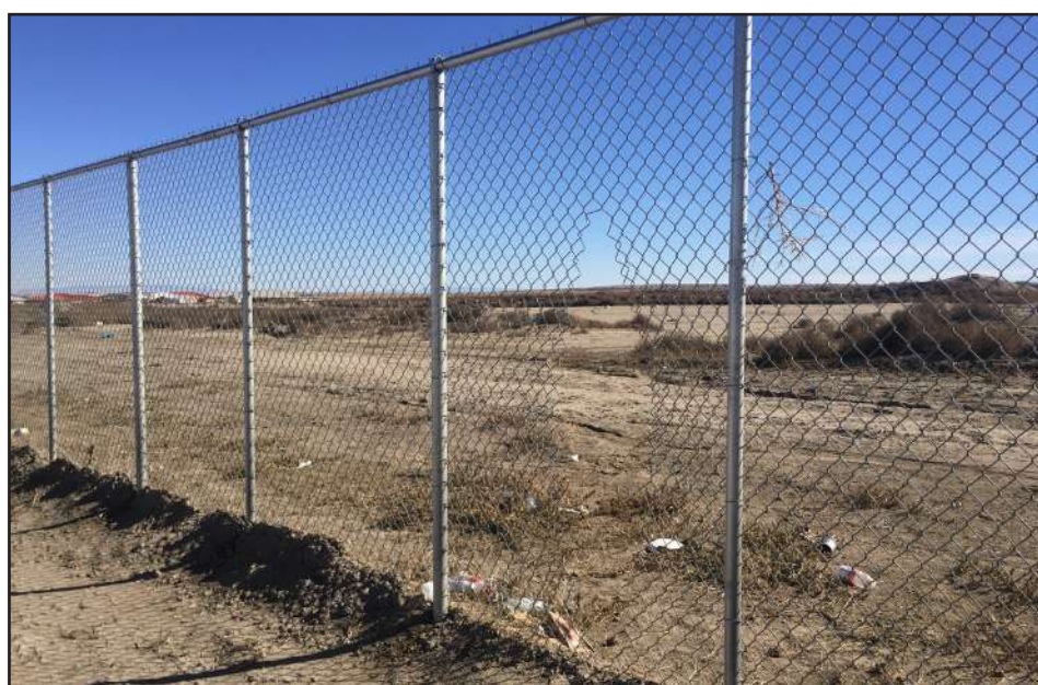
Kayenta, Ariz. - Fence was damaged at Kayenta Rodeo Grounds. Crew were called to provide maintainance at rodeo grounds.