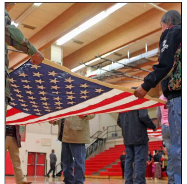
Kayenta, Ariz. - Veterans Day event November 11,