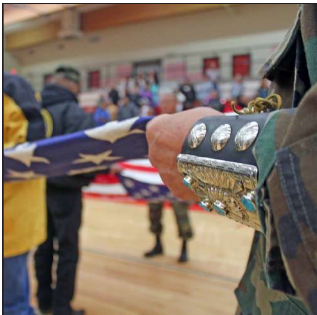
Kayenta, Ariz. - Veterans Day event November 11, 2015