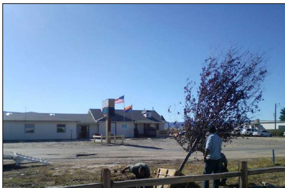
Kayenta, Ariz. - Trees were planted in and around the Township and also at the new Corrections Facility. Trees are part of the Beautification Project.