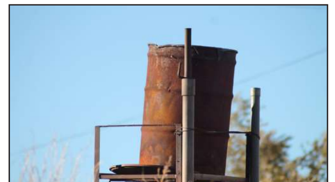
Kayenta, Ariz. - A barrel is found near the street, trash burning in the township boundaries are discouraged.