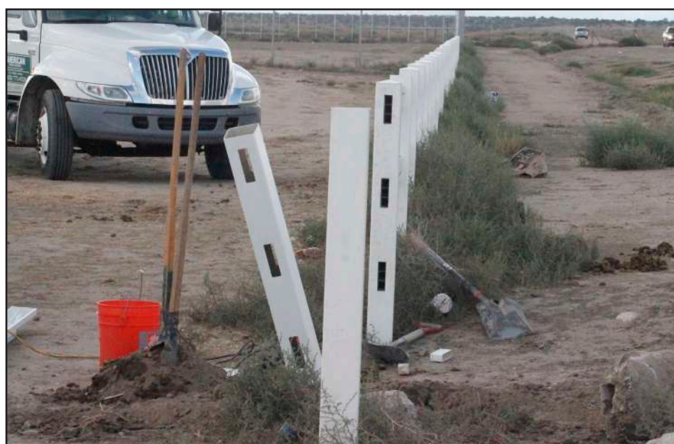
Kayenta, Ariz. - Fence repair and add ons at Vendor Village. Fence was recently damaged by vehicle moving in and out of Vendor Vil-