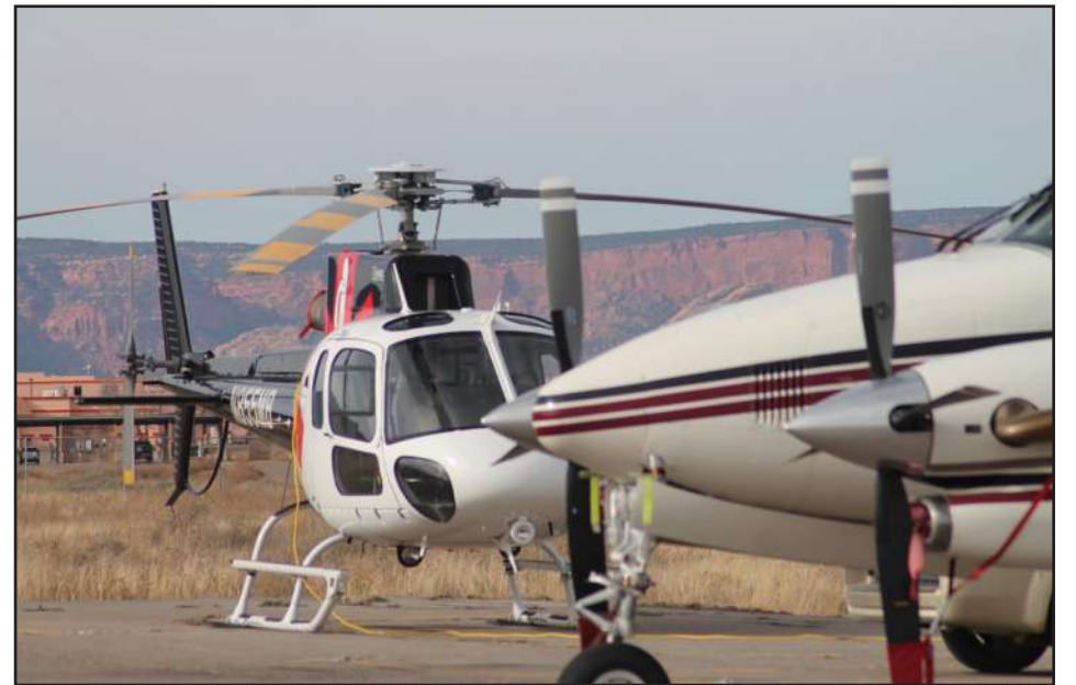
Kayenta, Ariz. - Helicopters and planes are parked at Kayenta Airport.