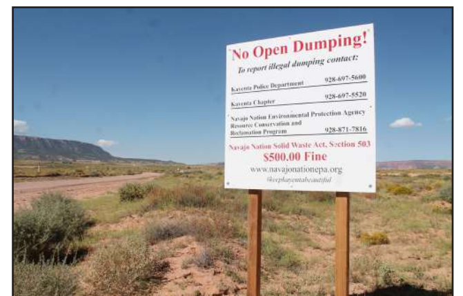
Kayenta, Ariz. - Signs were strategically placed in and around Kayenta Community to provide awareness for Open Dumping and provide information regarding fees and fines of illegal dumping.

discourage other people from dumping. You might inspire others to follow your lead. Promote your success. Local publicity, such as a press release sent to a newspaper, presentation at the chapter or at local schools can inform the local community of the problems of illegal waste dumping and inform them of what action you have taken to clean up dumped waste and prevent future dumping. You might inspire others to follow your lead. Promote your success. Local publicity, such as a press release sent to a newspaper, presentation at the chapter or at local schools can inform the local community of the problems of illegal waste dumping and inform them of what action you have taken to clean up dumped waste and prevent future dumping. In the future, report each illegal dump to authorities as soon as you become aware of it, and provide as much information as possible. If authorities can track down the dumpers they can issue them with penalties and make them clean up the dumped trash.