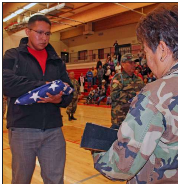
Kayenta, Ariz. - Veterans Day event November 11,