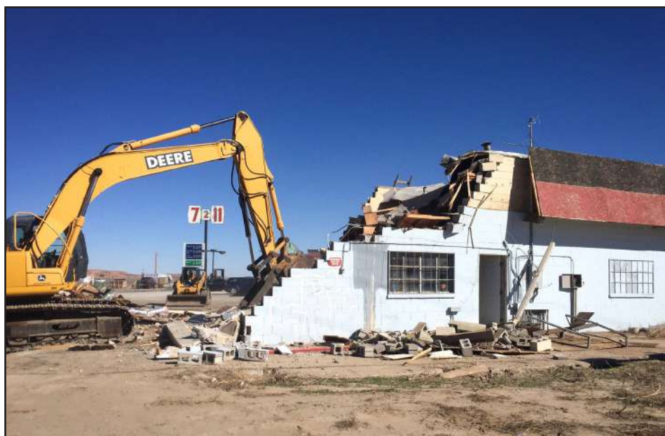
Kayenta, Ariz. - The old Speedy's Gas Station at the intersection of U.S. Highway 160 & 163 part of a demolition project.